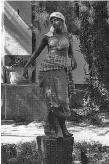
Spomenik ciganki koja je otkrila lekovitu vodu

Let's consider with respect the events of the last century. Let's be proud of their results. And let's act the way that the ones who come after us can be proud of our results as well. Let's learn from our mistakes and let's trust the wonderful and unique power of the thermal water.